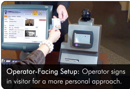
Operator-Facing Setup: Operator signs in visitor for a more personal approach.